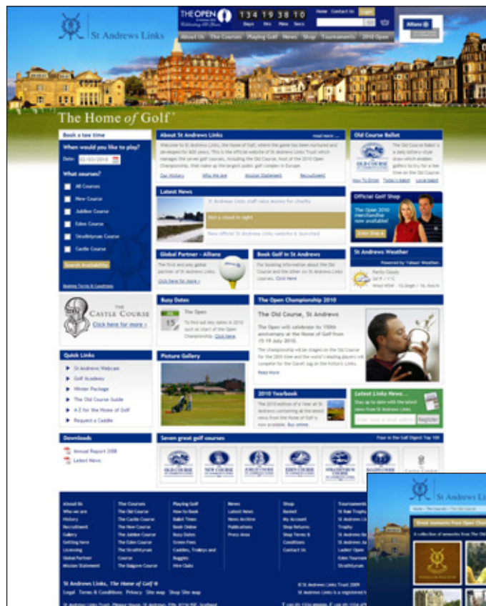
● The home page

"The new site will be a platform which will enable us to introduce many new innovations in the months and years ahead. It is an indispensable tool for all those who have an interest in playing golf in St Andrews or simply finding out more about the place."