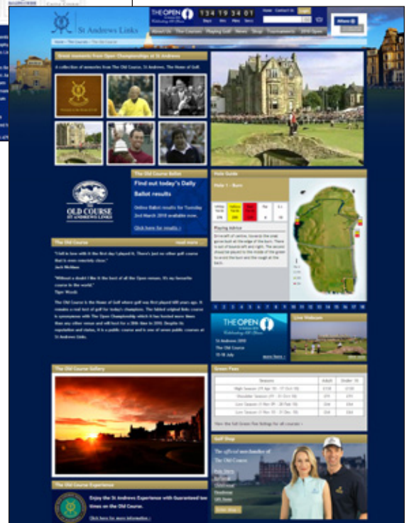
● The Old Course page has a film of St Andrews Open Champions

To access the new official website for St Andrews Links visit: www.standrews.org.uk .