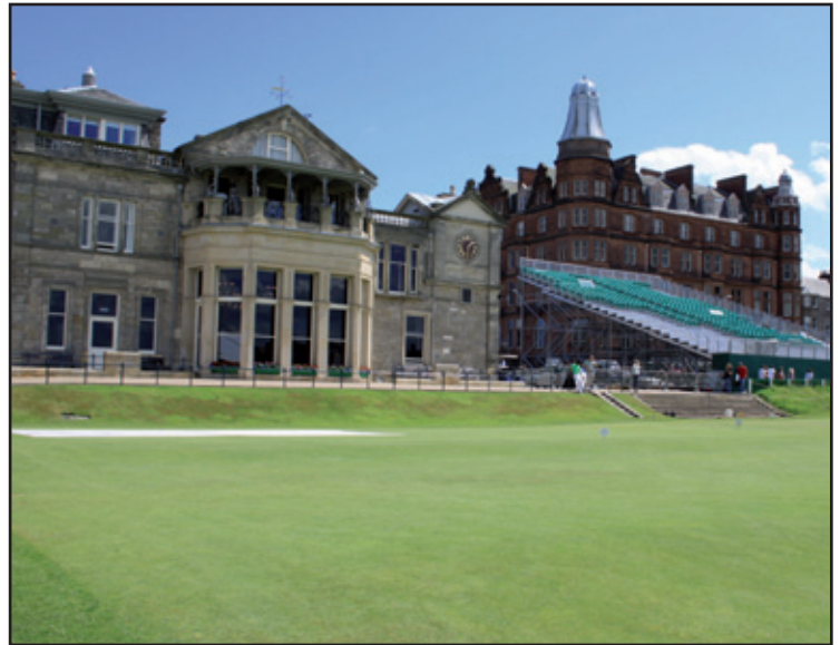
● The first tee of the Old Course awaits the Open Championship.