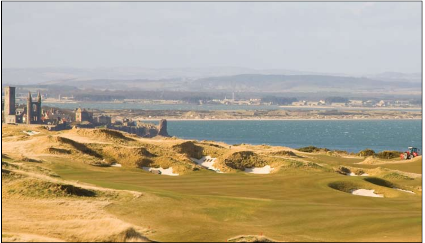
● Work on preparing The Castle Course for its first full season has been continuing throughout the winter months.

The Castle Course, the seventh course at the Home of Golf, has its first full season in 2009 starting on 1 April and running until 1 November.