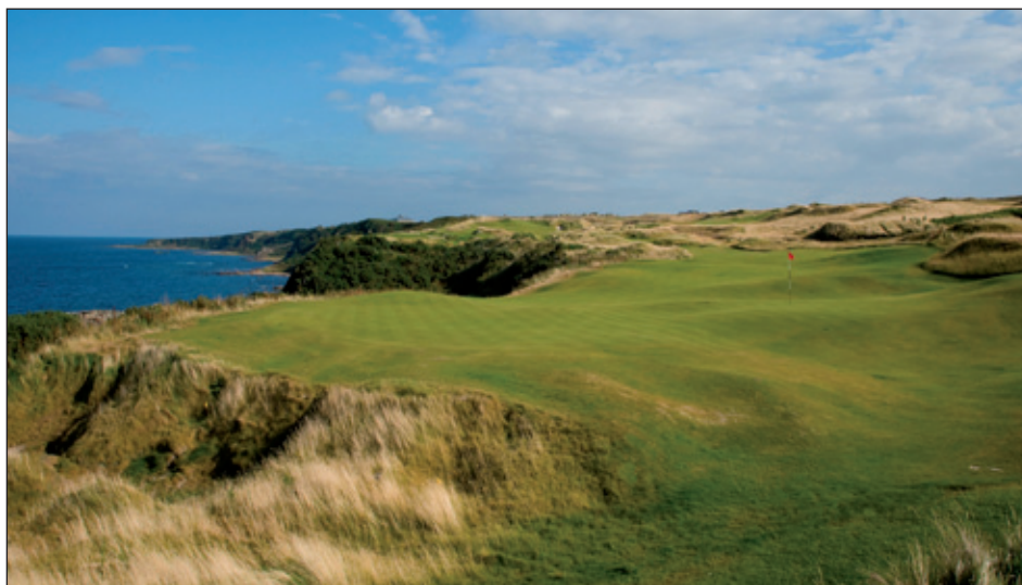
● The 17th green of The Castle Course.

The Old Course is known around the world as the Home of Golf and regularly features highly in international rankings and its younger sister, The Castle Course, has also earned its fair share of awards. In 2008, when it opened, The Castle Course was named by Travel & Leisure Golf magazine as the New Course of the Year and International Development of the Year by Golf Inc magazine in America. The course was also included in the prestigious Golf Digest Top 100 Courses in its first year alongside the Old, New and Jubilee courses.