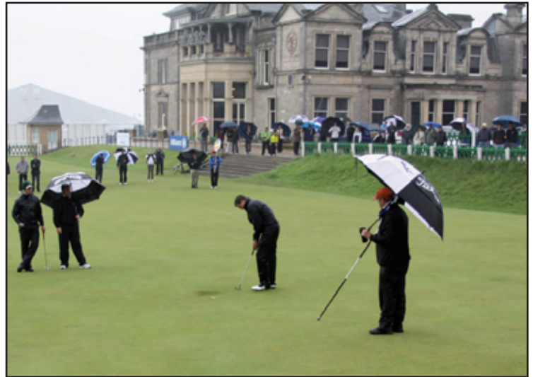
● Matthew Southgate holing the winning putt