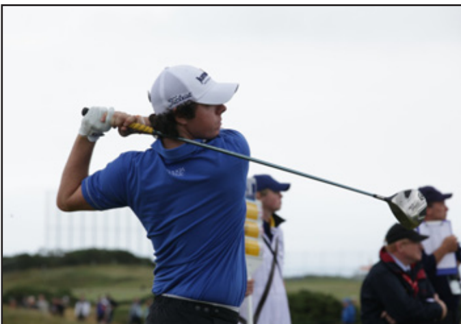
● Rory McIlroy opened the Championship with a record breaking score of 63 but never regained the lead finishing third.