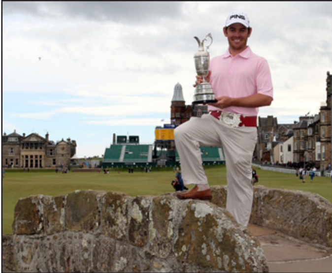
● Louis Oosthuizen led from the second round to finish with a winning score of 16 under par.