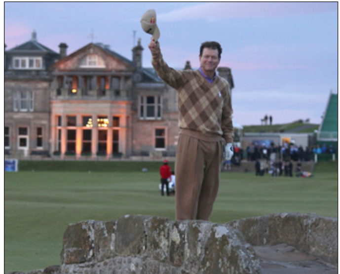
● Tom Watson bids farewell to St Andrews on his way to missing the cut by two shots.