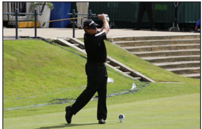
● Lee Westwood tees off for the final round which took him to second place in the championship.