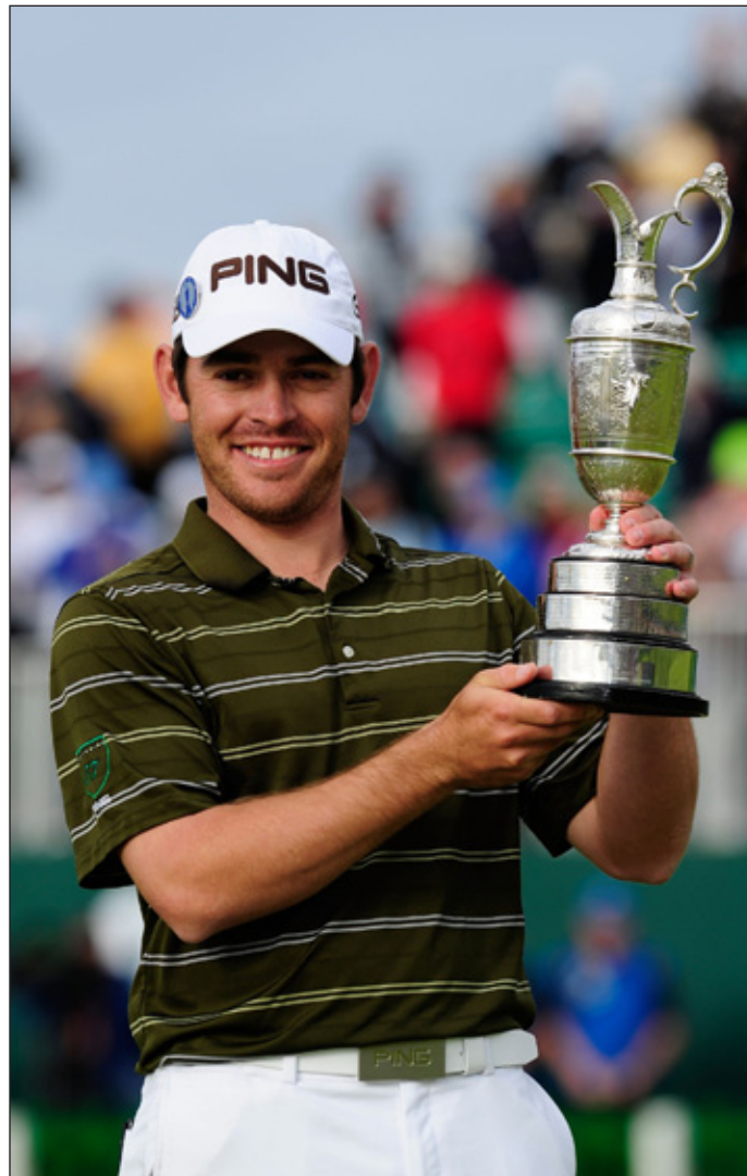
● Louis Oosthuizen with the Claret Jug

The likes of Lee Westwood, Paul Casey, Rory McIlroy, Henrik Stenson and Martin Kaymer were left wondering what might have been but in the end none of them really managed to exert pressure on Oosthuizen.