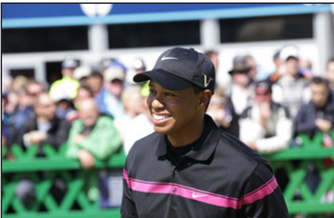
● Tiger Woods was never really in contention for what would have been his third St Andrews Open victory.